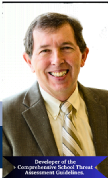
Developer of the Comprehensive School Threat Assessment Guidelines.

Location: Southern Connecticut State University (SCSU) New Haven, CT 06515